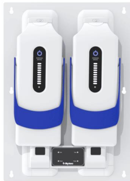
Dual Bay Charger