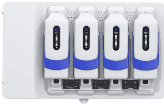
Quad Bay Charger